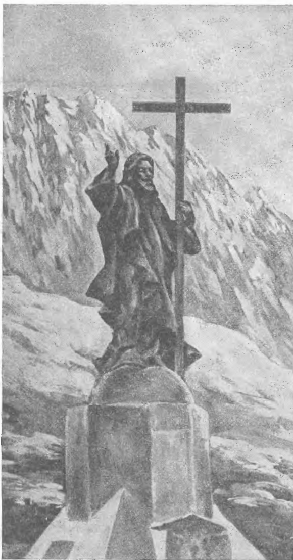
THE CHRIST OF THE ANDES Story on Page 7

The Incomparable Christ . . . More than nineteen hundred years ago there was a man born contrary to the laws of life. This man lived in poverty and was reared in obscurity. He did not travel extensively. Only once did He cross the boundary of the country in which He lived; that was during His exile in childhood. His life's work was confined to a little place much less in size than the State in which I live.