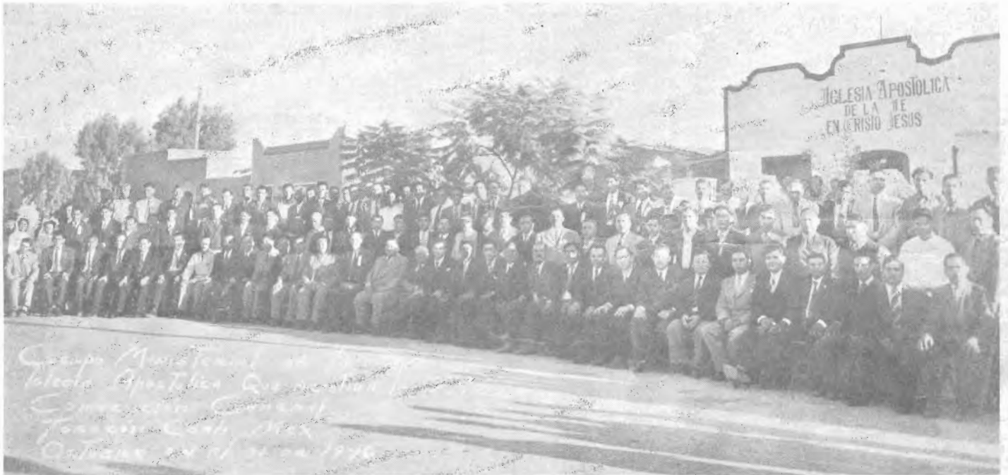
Ministers who attended the XV Convention of the Apostolic Church of the Faith in Christ Jesus at Torreon, Coahuila, October 24-31, 1946.

The Convention came to a close with a large crowd present on Thursday night, October 31st. Twenty brothers were ordained for the ministry and others were removed from their present fields of labor and sent to open new works in different parts of Mexico. We are looking forward, if Jesus tarries, to