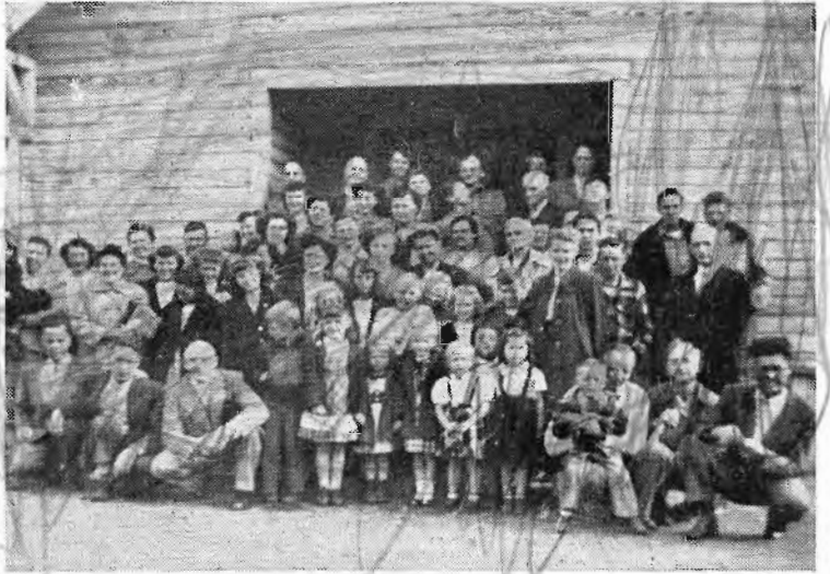
United Pentecostal Church — McCleary, Washington