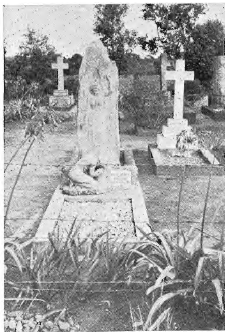
The grave (forefront) of a missionary's 17 year old daughter. This missionary, now in his old age, has carved this beautiful stone with the form of a girl kneeling in front from the rocks of Africa. This graveyard is on a lonely hilltop in Zululand. Many missionaries are buried here. There are 10,000 missionary graves in Africa, and the battle is not won — pray.