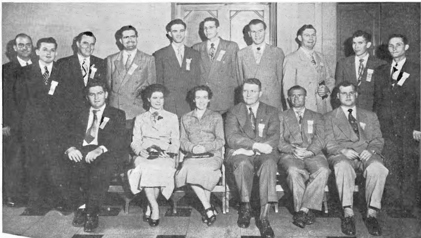
A picture showing the 1951 General Conference Young People's committee.

(6) Please send all monies to United Pentecostal Church, 3449 S. Grand Blvd., St. Louis 18, Missouri. Designate these offerings as from the PENTECOSTAL CONQUERORS TO APPLY ON THE TRUCK PROJECT OF THE CONQUERORS. THIS IS IMPORTANT!