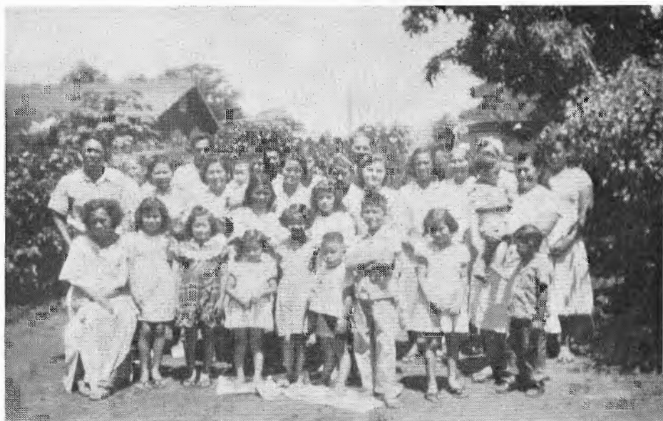
Group of Believers in Hawaii