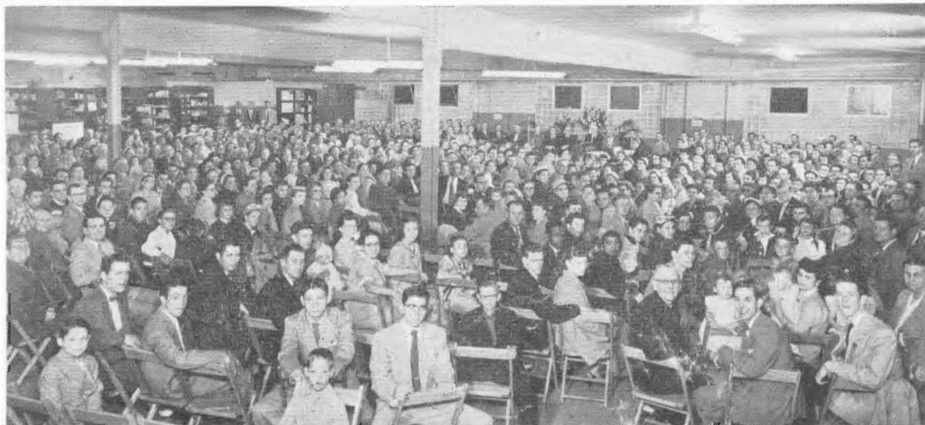
Picture showing the crowd assembled for the grand occasion of dedicating the new headquarters building in St. Louis,

United Pentecostal Church 3645 South Grand Blvd. St. Louis, Missouri