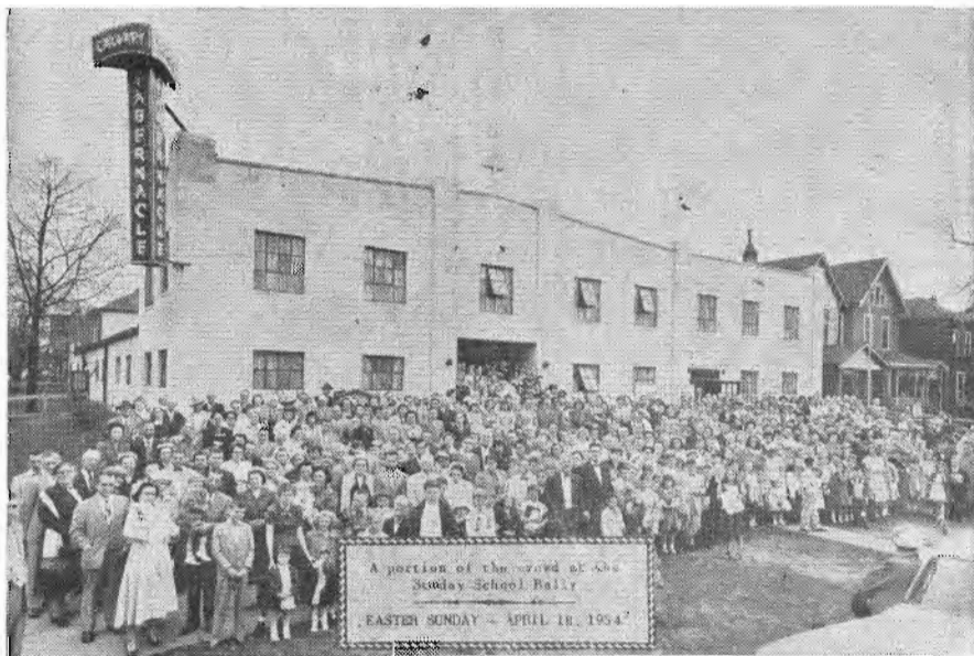
Over 1200 attended Calvary Tabernacle, Indianapolis, Ind., for Easter Sunday Services. Presumably, this was the largest attendance among our churches.

Middletown, Ohio — The last twelve nights in February will be remembered by the congregation and friends of Truth