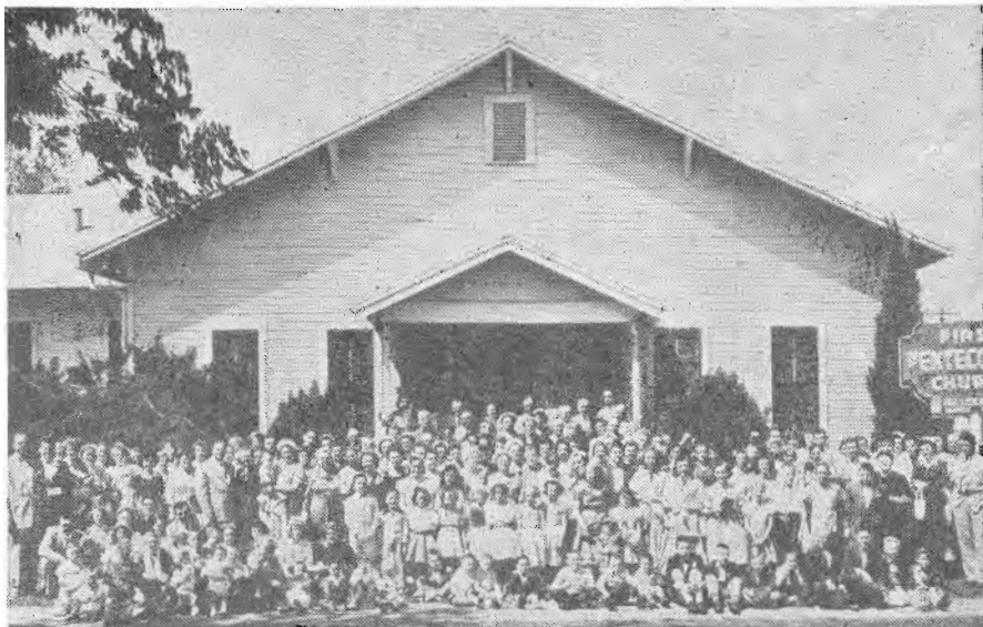
Easter Sunday congregation at the First Pentecostal Church of Sherman, Texas.