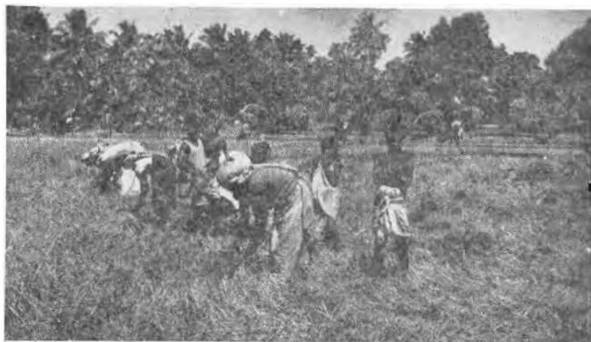
Working in the Fields

A WEALTHY farmer who cultivated some thousands of acres, had by his benevolence endeared himself greatly to his large staff of laborers. He had occasion to leave the country in which his property was situated for some years, but before doing so he gave his people clearly to understand that he wished the whole of the cultivated land to be kept in hand, and all the unreclaimed moor and marsh lands to be enclosed and drained and brought into cultivation; that even the hills were to be terraced, and the poor mountain pastures manured, so that no single corner of the estate would remain neglected and barren. Ample resources were left for the execution of these works and there were sufficient hands to have accomplished the whole within the first few years of the proprietor's absence.