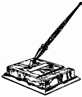
From the Editor's Pen