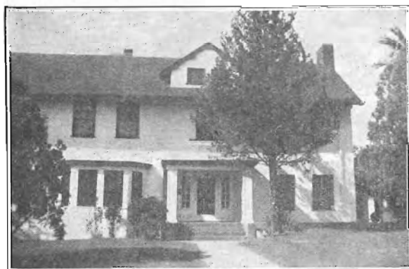
EMMANUEL BIBLE TRAINING SCHOOL

Other members of the Bible School staff will